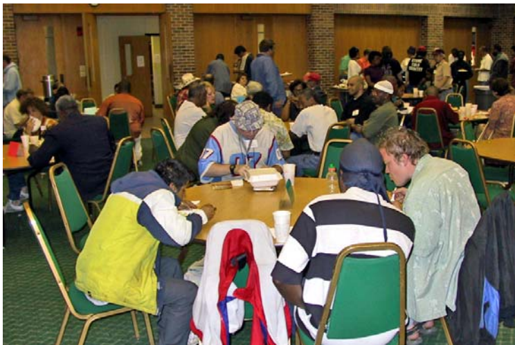
Dinner at "Saturday Night Life"

Many of you ask, "How can you do this work?" To be quite frank, sometimes I am not sure.