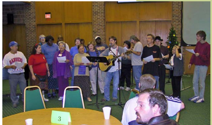
Our Christmas choir rehearsing for a December 4th concert!

If you have extra items around your house, here is a place they can go to good use!